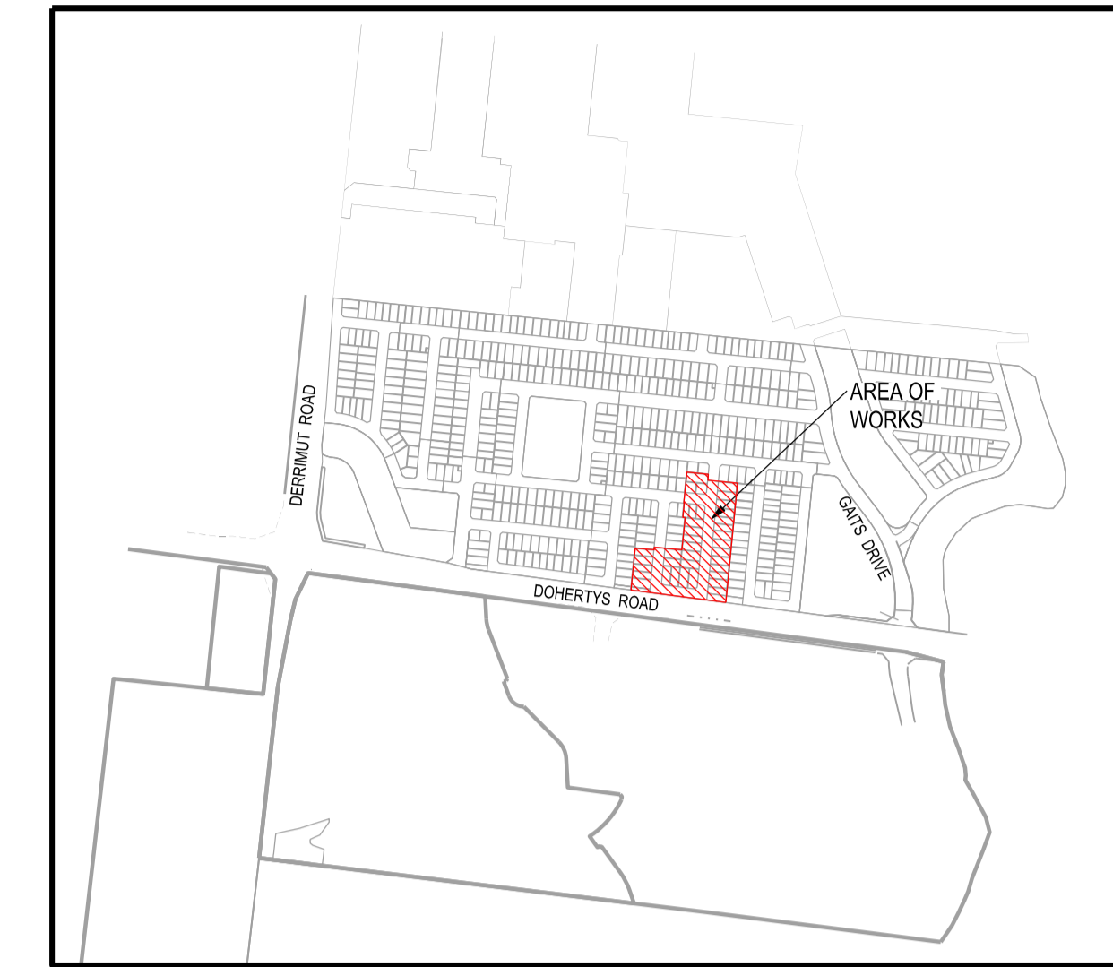
LOCALITY PLAN SCALE 1:20000